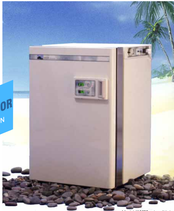
Model 4150T Tropicool Variant

NOW WITH INFRA-RED SENSOR FOR MORE INFORMATION TALK TO CONTHERM