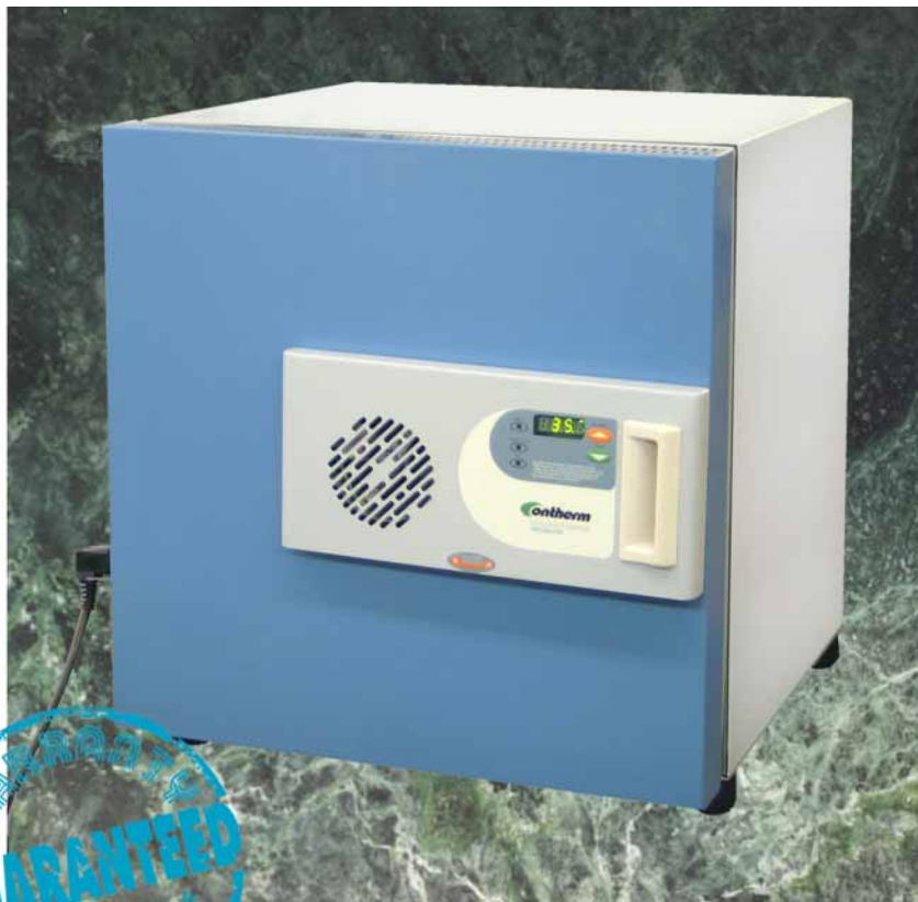
Model 7050 Designer Series