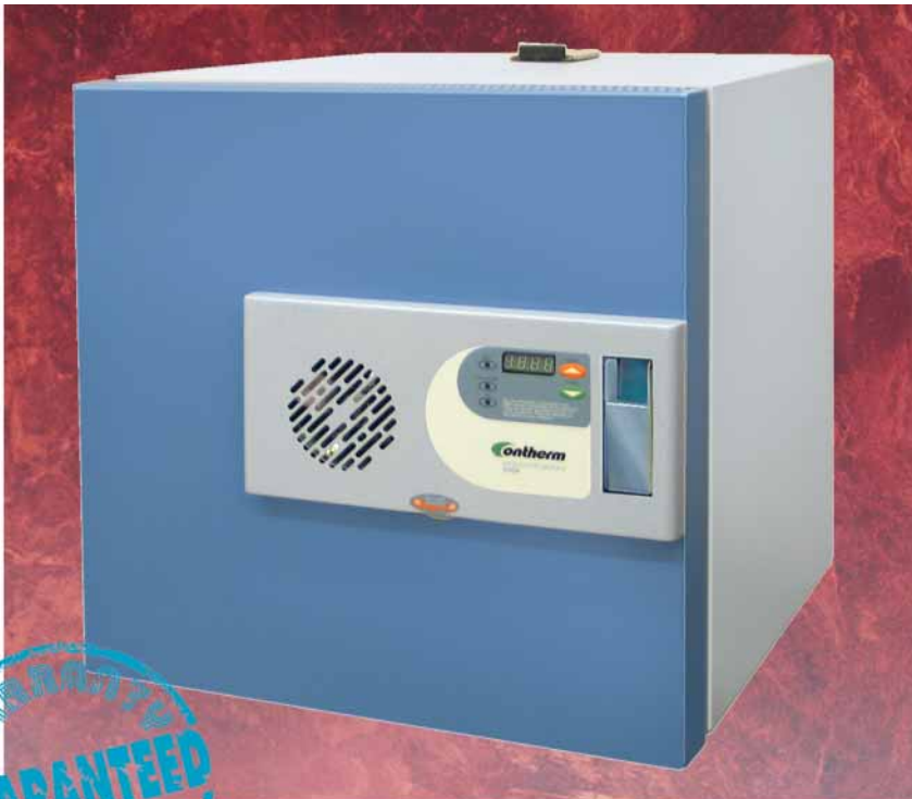
Model 8050 Designer Series

The Contherm Thermotec Designer Series Ovens offer the laboratory professional maximum performance and reliability in an attractive and economical package. Manufactured in a quality production environment, these units are designed to AS/NZS3350 and IEC335 electrical standards, and carry the CE Mark.